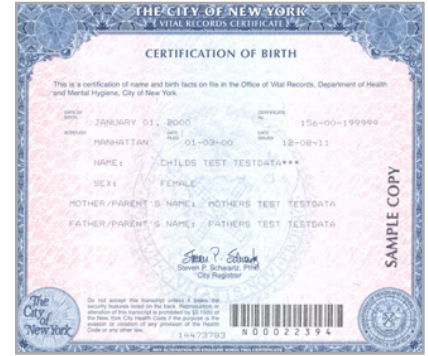
EXAMPLE: BIRTH CERTIFICATE